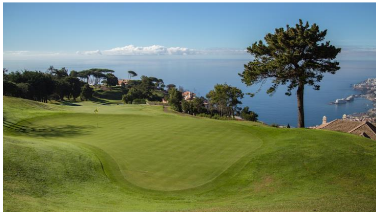
Palheiro Golf Course pictured above