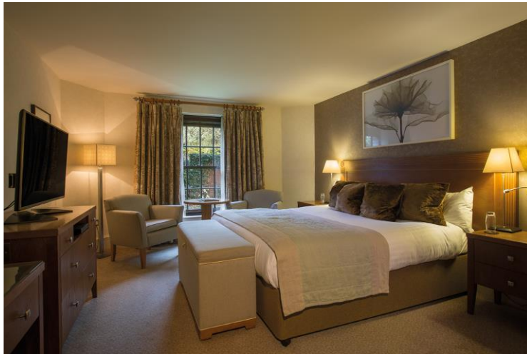
Classic room in Garden Wing pictured above

Suite: ARBH is not holding any suites. However it may be possible to book a suite, subject to availability and cost. Please contact us for further information.