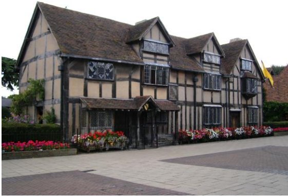
Shakespeare's Birthplace, the 16th Century Half Timbered House

ARBH will arrange a half day optional excursion, to include lunch, to either nearby Stratford-upon-Avon, birthplace to William Shakespeare, or possibly to Warwick Castle (pictured below) or Blenheim Palace. Please note that the excursion is not included in the package price, the itinerary is subject to change and minimum numbers apply.